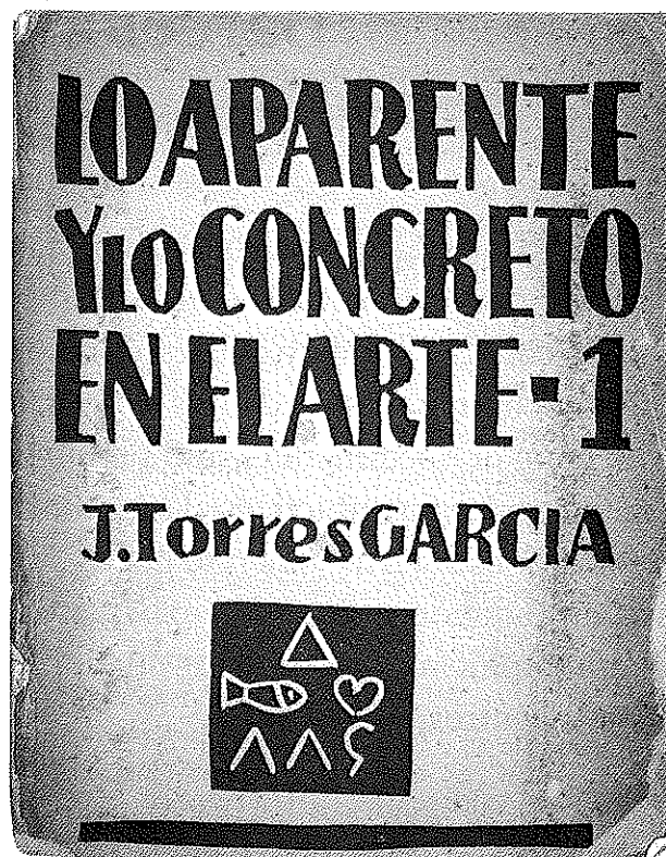
Joaquín Torres García, Lo aparente y lo concreto en el arte (Montevideo: Asociación de Arte Constructivo, 1947)

Together with these temporal and geographical parameters, a series of key themes guided acquisition of new holdings in this first phase of the Study Centre's activities. It is worth noting some of the more relevant of these, although it should be emphasised that this list is by no means exhaustive, and that the work dynamic which shapes these collections involves the gradual incorporation of other key themes, as certain territories are covered and research unveils new areas of interest.